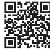
《Kobe Model for Dementia care website》

Your local hospital or clinic (As of April 2019, there are 375 medical providers that offer screenings for dementia. Please see the Kobe Model for Dementia care website for more information and a list of places that offer them.)